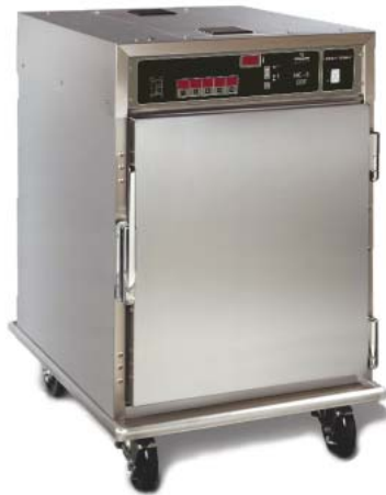
HC-5 Heated Holding Cabinet shown with Count Down Timer (CDT) controls. Holds 5 full-size sheet pans.