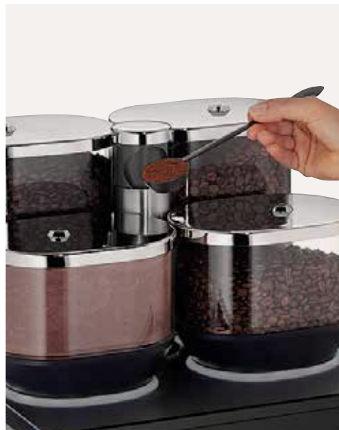
Manual insert Enables the additional use of e.g. decaffeinated coffee for individual cups.