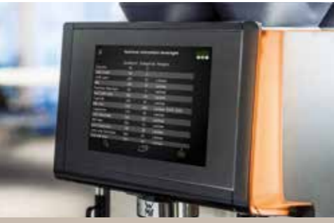
Nutritional information Meets customer demand for greater transparency: during preparation of a coffee speciality, its ingredients and nutritional values can be shown on the display.