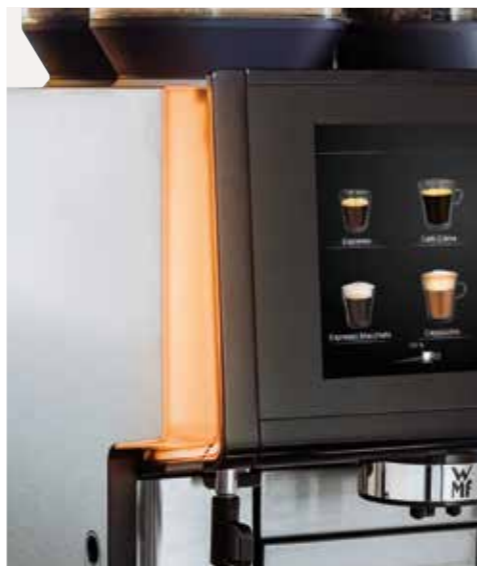
Illumination The illumination of the side parts and bean hopper can be adjusted individually to suit each ambience. The side parts also flash when you need to do something (e.g. when the coffee beans need to be refilled).