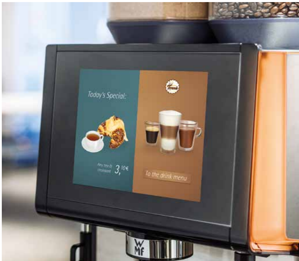
Advertising possibilities Additional turnover right in front of your nose. On the 10-inch display, advertising animations or special offers can be integrated in SB mode (self-service mode).