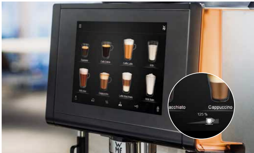
Individual beverage settings Coffee, milk and foam volume and even the cup size can be flexibly and individually specified.