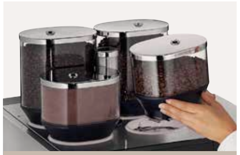
Removable product hoppers The four product hoppers are easy to remove (with central lock). They are also dishwasher-proof for practical and easy cleaning.