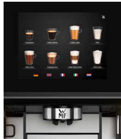
Language selection The nationalities that the WMF 9000 S+ can cater for are as varied as the selection of beverages it offers. Customers and staff can change the language with immediate effect even during operation.