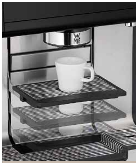
Cup lift Particularly practical in SB mode (self-service mode). The patented cup lift automatically lifts cups and glasses to the optimum clearance height.