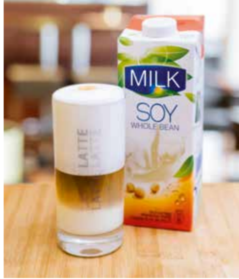
Dynamic Milk 2-milk Enables the use of two milk types such as normal and low-fat, soya milk or lactose-free milk. The latter guarantees automatic cleaning on changeover, meaning that the designation "low lactose" can be used for beverages.