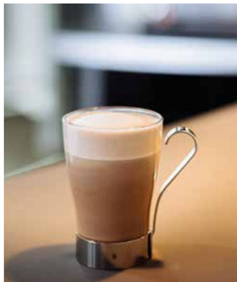
Choc mixer The new Choc mixer for tasty milk chocolate or chociatto appeals with its simple handling, low maintenance requirements and extra long life. More chocolate drinks, lower lifecycle costs.